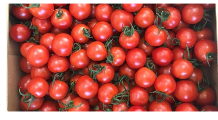
Supporting organizations (tentative)