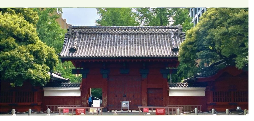
5. Purpose and Significance of the Conference